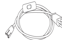
36" T5 Power Cord - INT-36-PC-SWITCH-TP 72" T5 Power Cord - INT-72-PC-SWITCH-TP (optional)